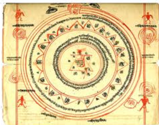
Tannic Painting, India c. 1800